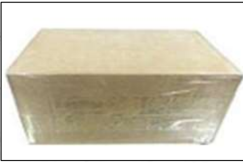
Pic No. 2