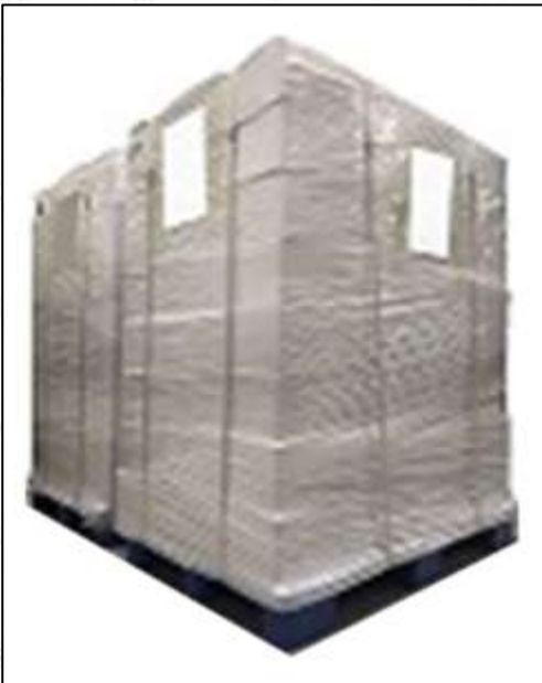
Pic No. 4

Wrapped with yellow tape after wrapping black protective film