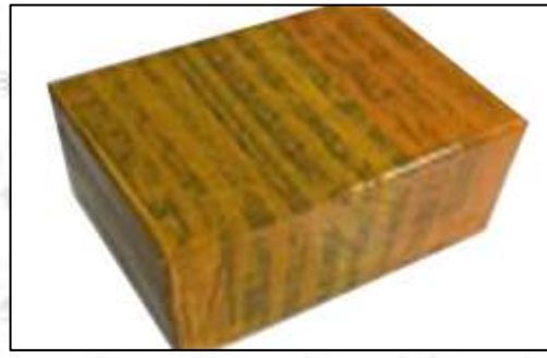
Pic No. 3